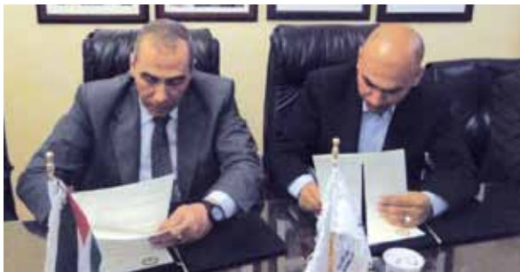
Bait Era and Yarqa Association 27/4/2015