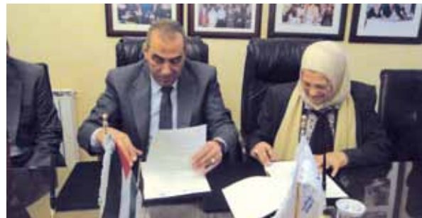
Families Development Association 27/4/2015