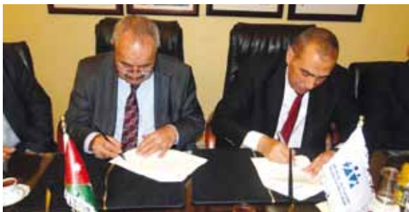
Jordanian Bar Association 28/10/2015