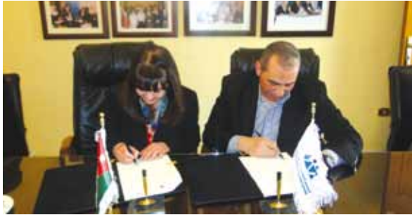
National Center for Clutuer and Peforming arts/King Hussin Foundation 3/2/2015