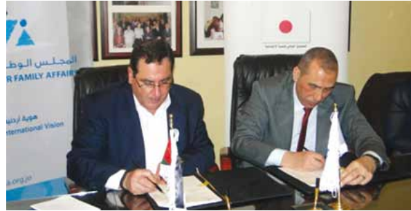
Justice Center for Aid 7/2/2015