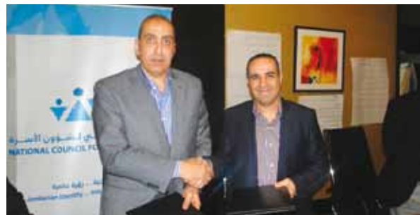
Questscop for Social Development 17/11/2015