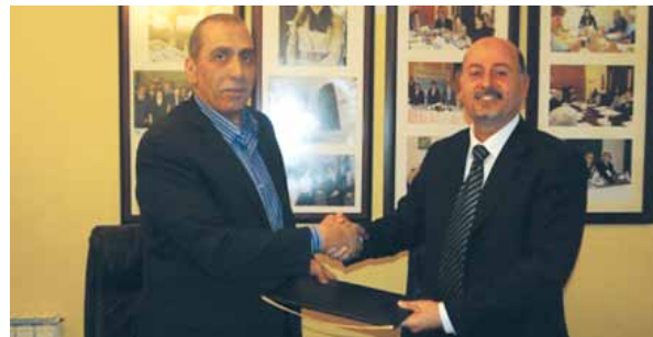
Seniors Without Borders Initiatives 18/3/2015