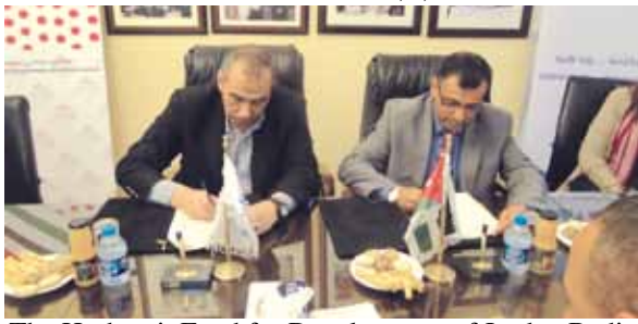
The Hashemit Fund for Development of Jordan Badia 7/2/2015