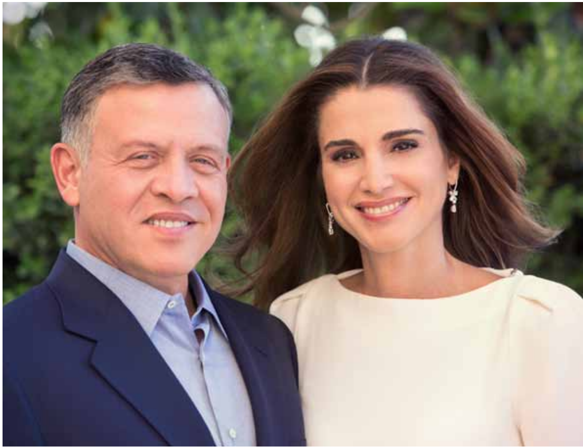
(His Majesty King Abdullah II Ibn Al-Hussein and Her Majesty Queen Rania Al-Abdullah)