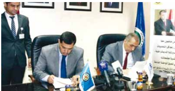
Civil Service Bureau 3/8/2016