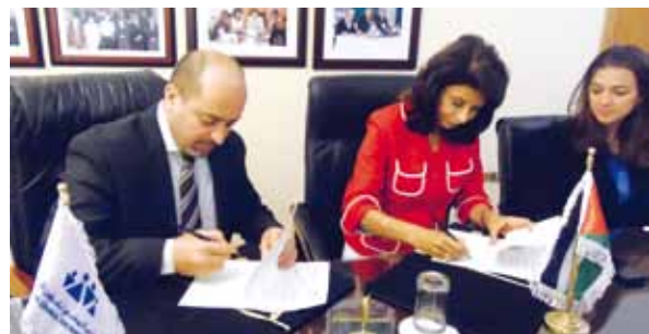
King Hussin Foundation 18/8/2015