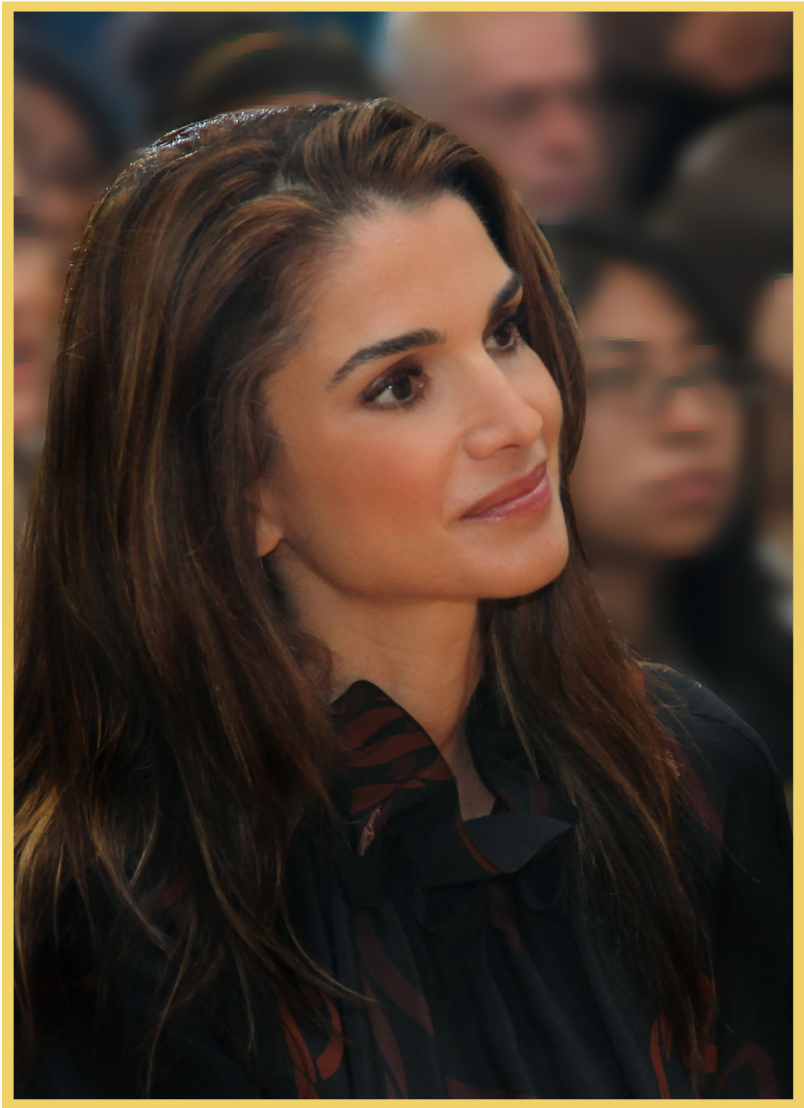
Her Majesty Queen Rania AL Abdullah President of the National Council for Family Affairs