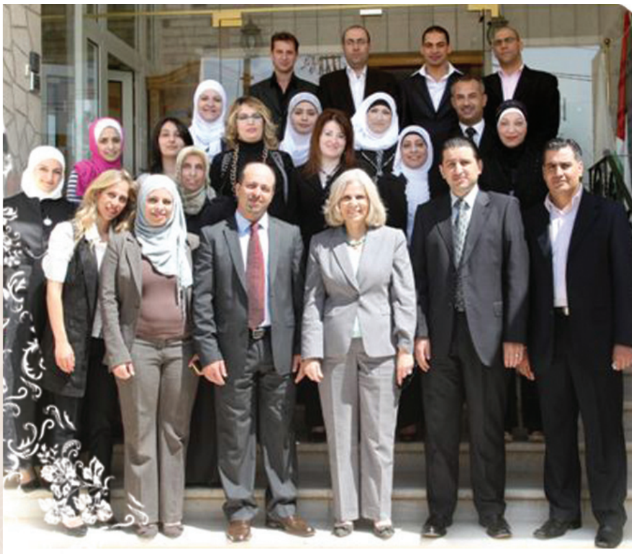
Staff Members of the National Council for Family Affairs

Functions as the NCFA's executive body and operational arm. The Secretary General supervises the General Secretariat team to achieve the NCFA's goals and mission. A team from different disciplines carries out its work and activities.