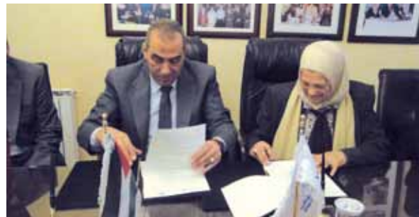
Families Development Association 27/4/2015