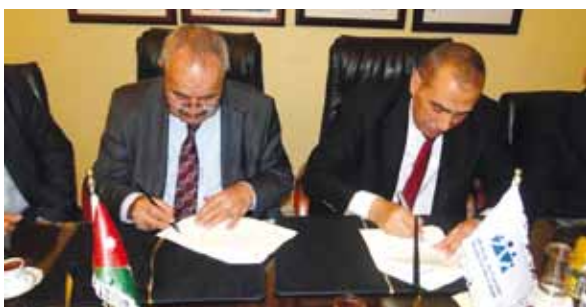
Jordanian Bar Association 28/10/2015