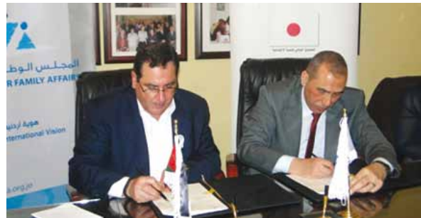
Justice Center for Aid 7/2/2015