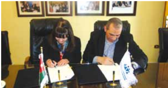
National Center for Clutuer and Peforming arts/King Hussin Foundation 3/2/2015