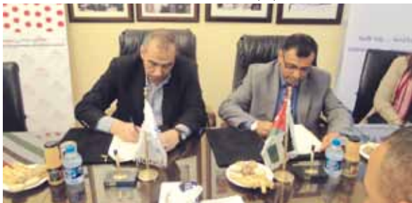
The Hashemit Fund for Development of Jordan Badia 7/2/2015