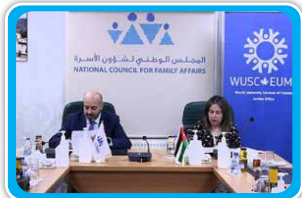
World University Service of Canada (WUSC)