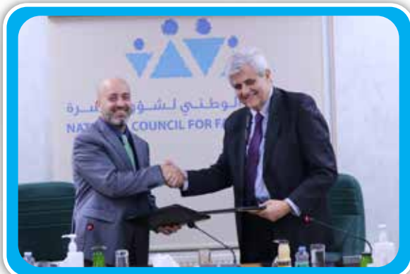
Arab Network for Early Childhood (ANECD) and the Arab Council for Childhood and Development (ACCD)