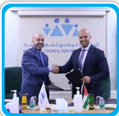
Generations for Peace