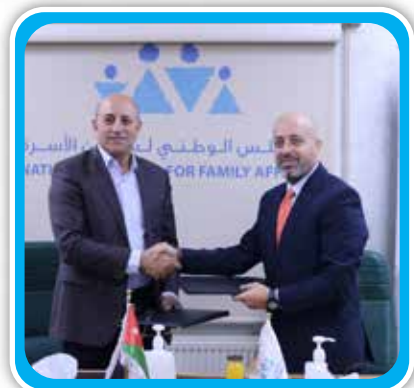
Jordan Hashemite Charity Organization