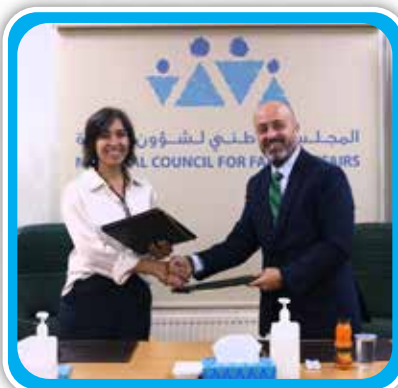
SOS Children`s Villages Jordan