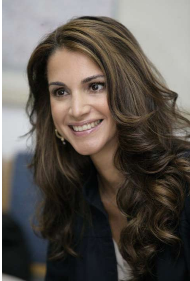
Her Majesty Queen Rania Al Abdullah President