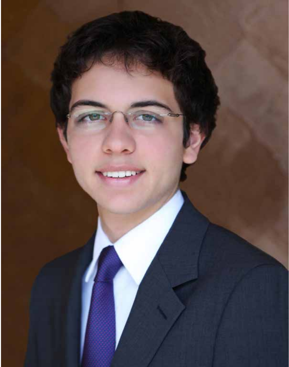
His Royal Highness Crown Prince Al-Hussein bin Abdullah II