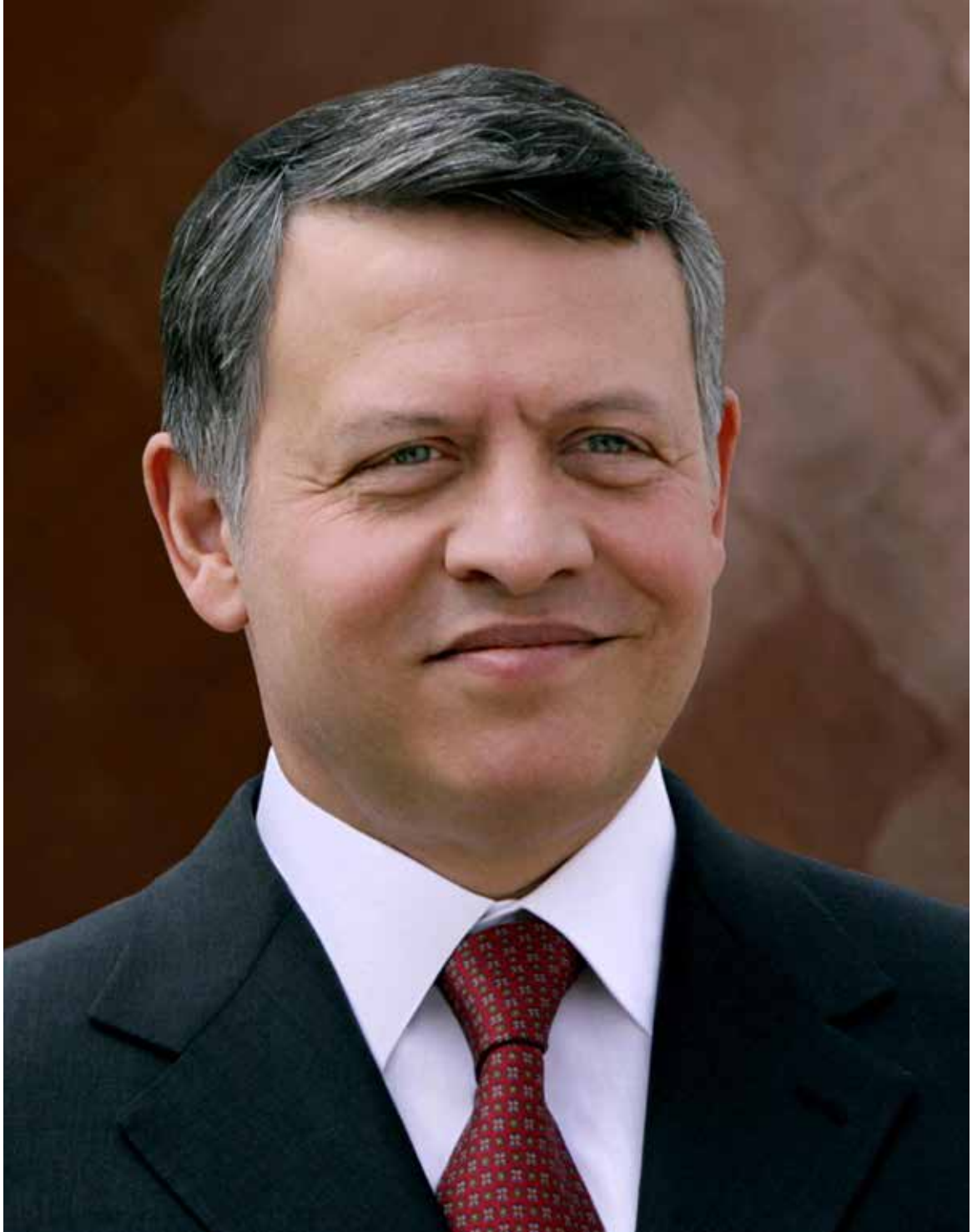
His Majesty King Abdullah II Bin Al-Hussein