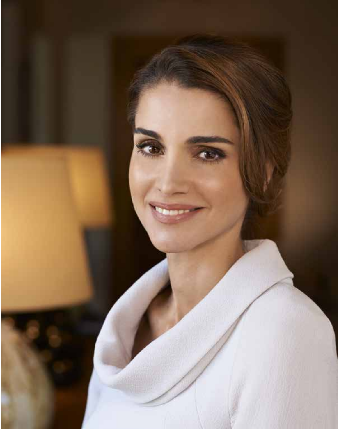
Her Majesty Queen Rania Al-Abdullah