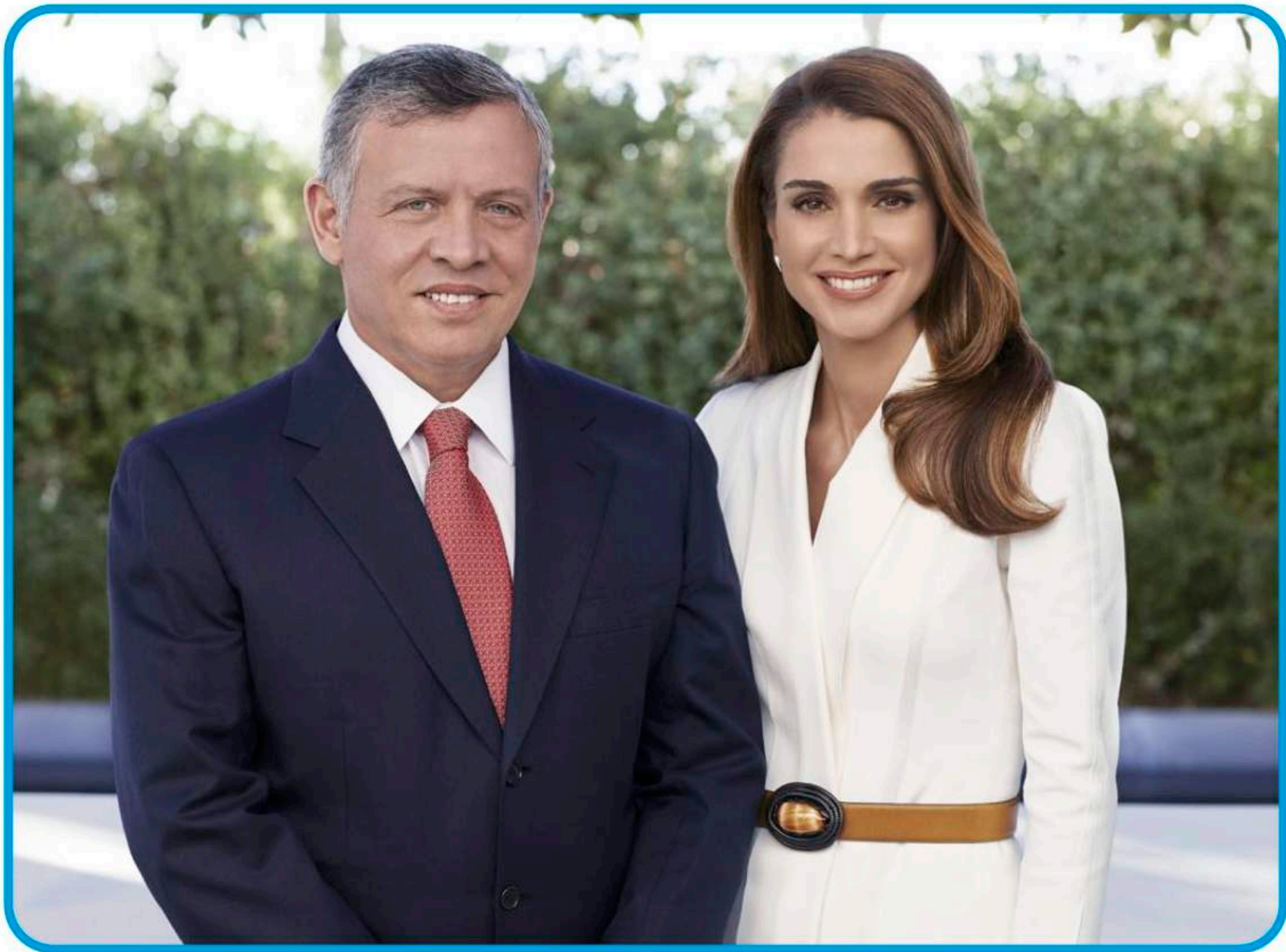
(His Majesty King Abdullah II Ibn Al Hussein and Queen Rania Al Abdullah)