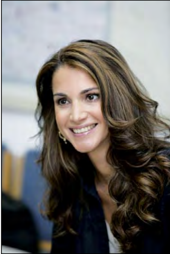
Her Majesty Queen Rania Al Abdullah President